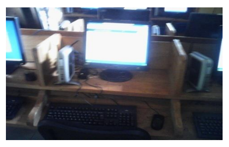
Fig. 2 Thin Client Server

Researches in assessment have approached the issue by examining the extent to which scores provided by CBT are comparable to scores provided by the PPTs. Since paper-and-pencil tests have precedence of use; they represent the gold standard to which CBT is compared. As PPTs are replaced by CBTs, the CBT scores need to be tied back in some way to the original PPT in order to maintain continuity. Watson (2001), and Wang and David (2010) reported that PPT and CBT