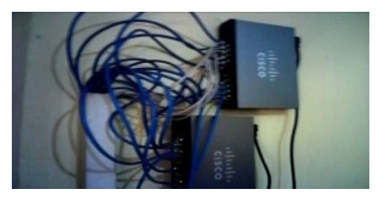
Fig.1 Network Switch

Item bank on the hand is a term for a repository of test items that belong to a testing program as well as all information pertaining to those items. Over here, items are of multiple choice formats, but any format can be used. Items are pulled from the bank and assigned to test forms for publication. Item banking saves time and energy. This is an added advantage over the conventional test development (Flaugher 1990).